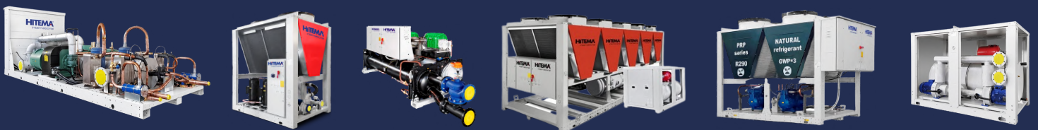
CWB SERIES 291kW ÷ 2240kW