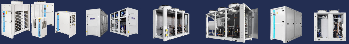
ENR/ENRF SERIES 1,6kW ÷ 440kW